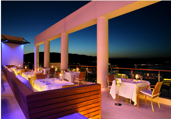
FIVE SENSES GOURMET RESTAURANT - TERRACE