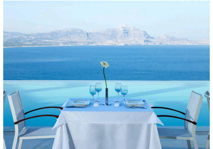
BREAKFAST – SMERALDO A'LA CARTE RESTAURANT