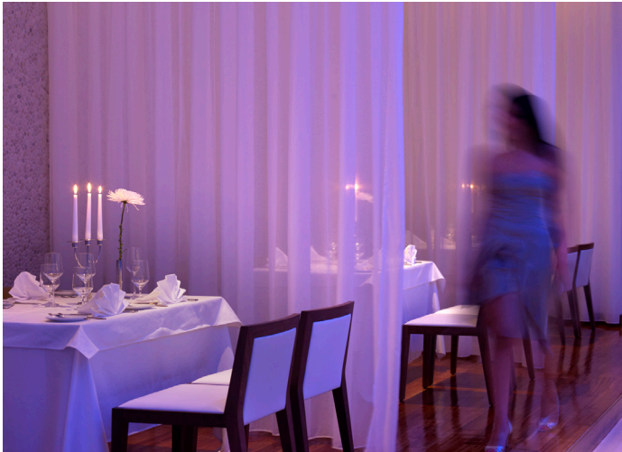
FIVE SENSES GOURMET RESTAURANT - INTERIOR